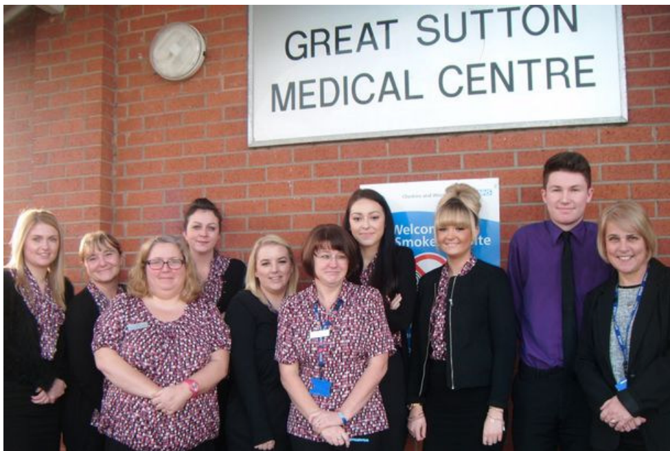
Great Sutton team

A scheme designed to improve the well-being of patients with long-term conditions including asthma and diabetes is scheduled to begin in the new year in two Ellesmere Port medical centres.